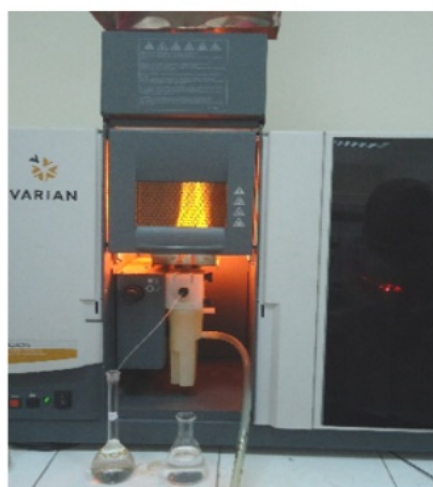
Figure 3 AAS machine is reading the sample